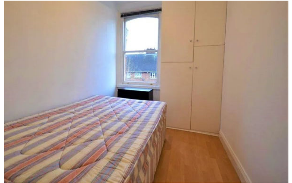
Buckley Road, Kilburn, London NW6 7NE £500,000 - Leasehold