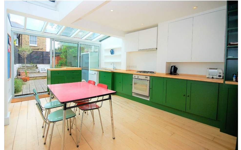
Kilburn Lane, Queens Park, LONDON W10 4AS £850,000 - Freehold