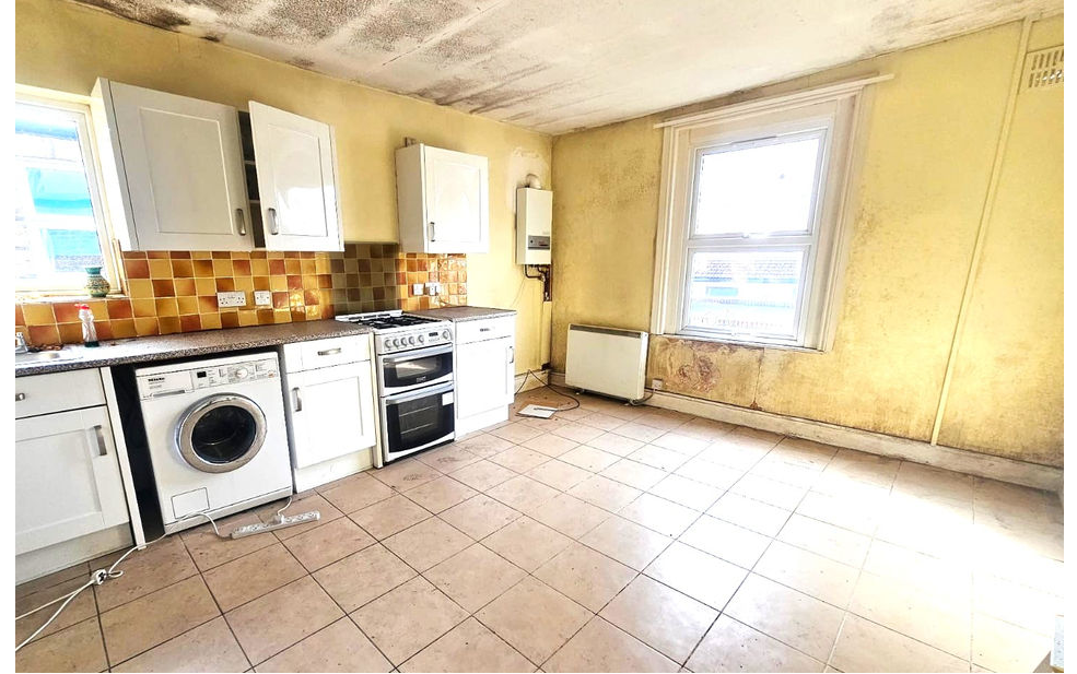
Chamberlayne Road, Kensal Rise, London NW10 3JH £729,000 - Leasehold