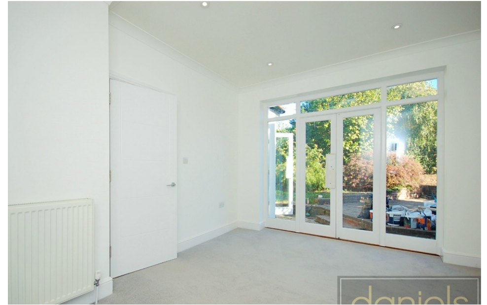
Hayland Close, Kingsbury, London NW9 0LH £500,000 - Share of Freehold