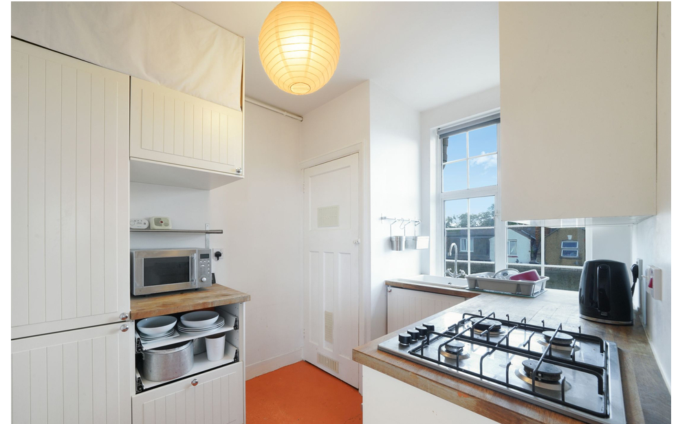
Gibraltar House, Connaught Road, Harlesden, London NW10 9AH £275,000 - Leasehold