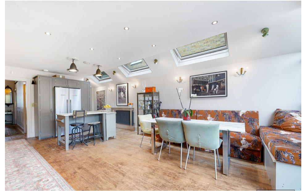
Mortimer Road, Kensal Rise, London NW10 5SN £1,400,000 - Freehold