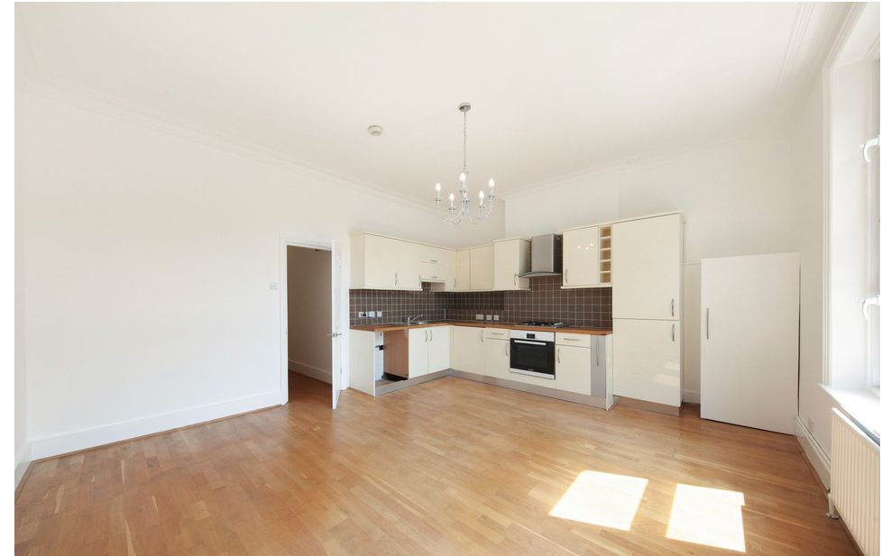
Chamberlayne Road, Kensal Rise, London NW10 3ND £425,000 - Leasehold