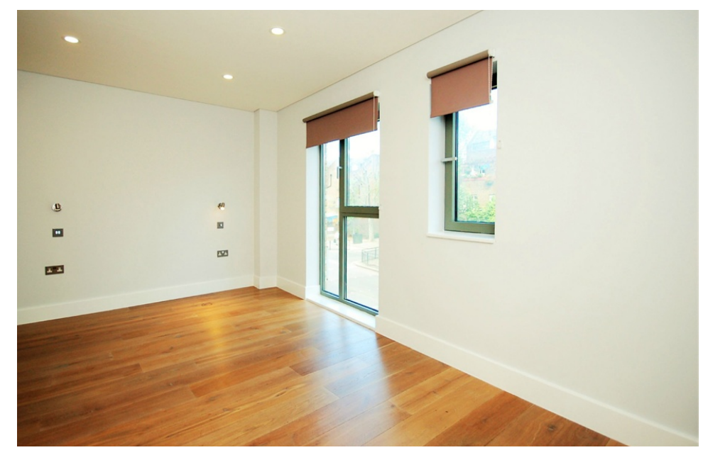
Waterside Apartments, 537 Harrow Road, North Kensington, LONDON W10 4RH £3,750 pcm