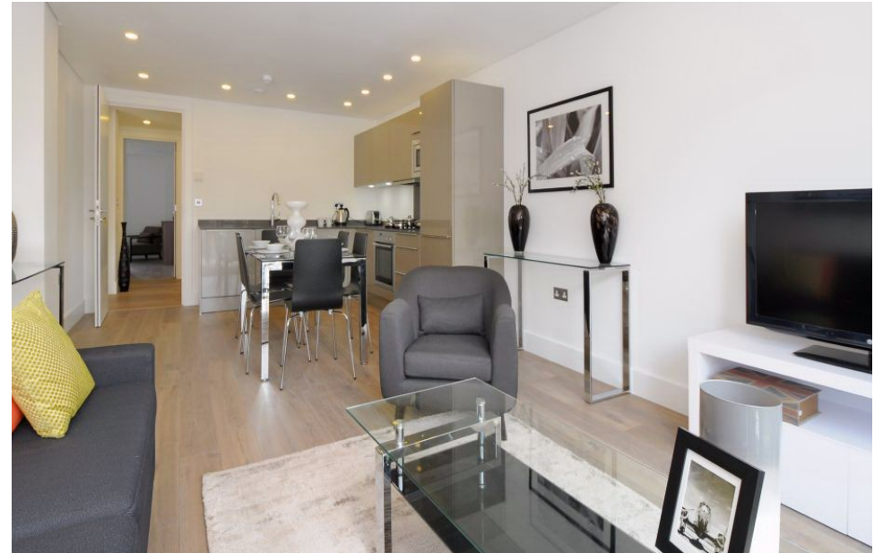
Waterside Apartments, 537 Harrow Road, North Kensington, London W10 4RH £3,750 pcm