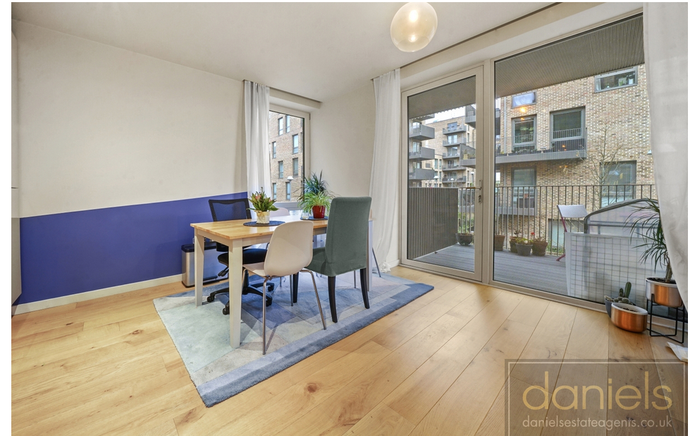
Copland Court, Durham Wharf Drive, Brentford, Greater London TW8 8FN £1,800 pcm